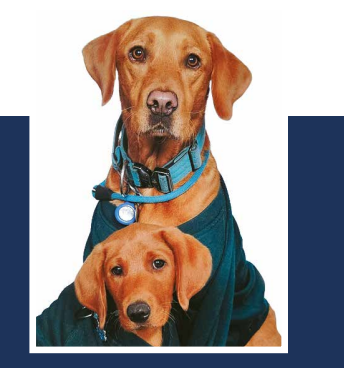
Marlowe & Sherlock Well-being Dogs